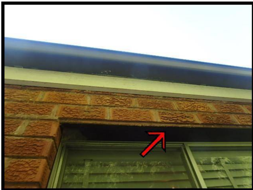
The lintels are of: Mild steel: Minor rust is evident to the steel in some lintels. This may reduce the service life of the lintels. This should be treated to prevent further deterioration.