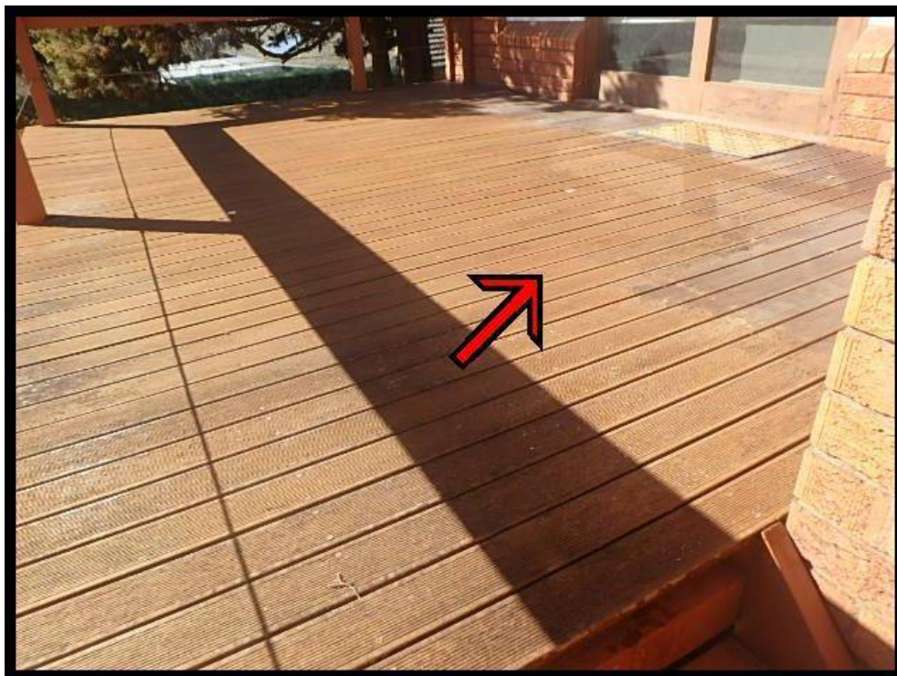
The decking timbers have been incorrectly installed, the groves allow water to pond and wet rot decay to develop.